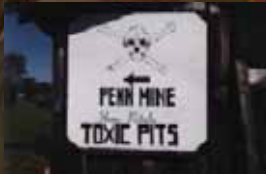
Penn Mine, CA