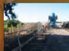
Flood Wall – S. Sac. Streams

Building Combat Readiness and Critical Infrastructure