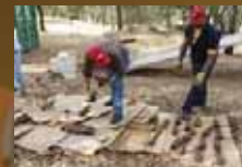
FUDS/UXO – Camp Beale