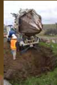
Elderberry Transplanting – American River

Trend for funding is down Corps-wide. Significant workload for Napa River and Lake Success Dam DSAP.