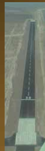
Michael Army Airfield Runway Expansion

Building Combat Readiness and Critical Infrastructure