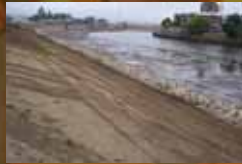
Channel Widening – Napa River