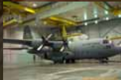
C-130 Hanger Hill AFB

Trend for funding is steady. Significant workload at Hill, Nellis and Beale AFB. More Design Build projects.