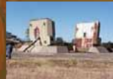
FUDS Titan Silo – Chico, CA

Trend for funding is in gradual decline.