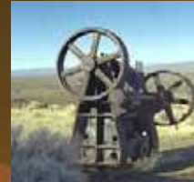
Berlin Mine, NV