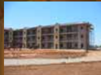
Global Hawk Dorm Beale AFB