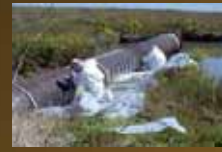
Hamilton Army Airfield