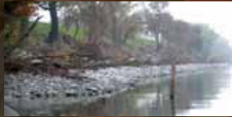
Bank Protection – Sacramento River

Trend for funding is down Corps-wide. Significant workload for Napa River and Lake Success Dam DSAP.