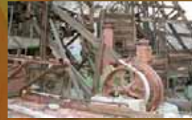
Corona Mine, CA

Building Combat Readiness and Critical Infrastructure