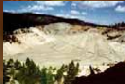
Leviathan Mine, CA